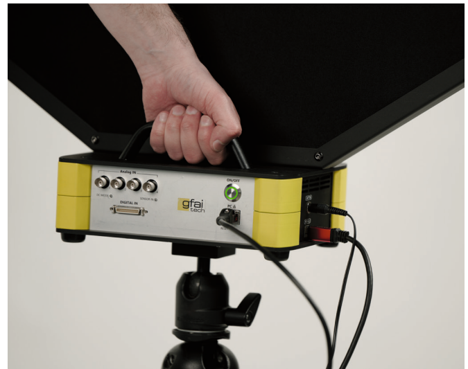
The Octagon can be placed on the ground or on a tripod

The fiber-carbon construction makes the Octagon stable and light at the same time, integrated handles allow for easy transport. All these features make the Octagon the perfect system for a wide range of applications in R&D, quality assurance, maintenance or environmental acoustics.