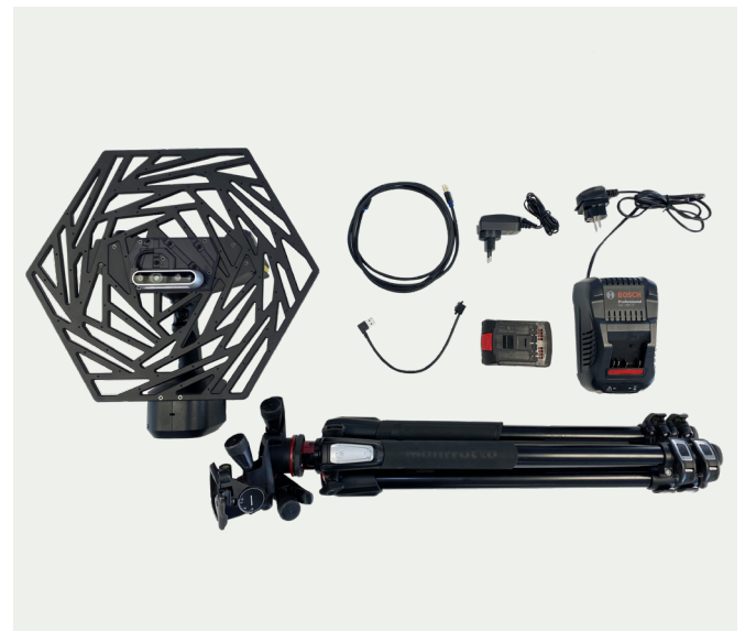
Acoustic Camera Mikado set with optional accessories

The array comes with an integrated Intel® RealSense™ depth camera which features Full HD resolution and the ability to record depth information.