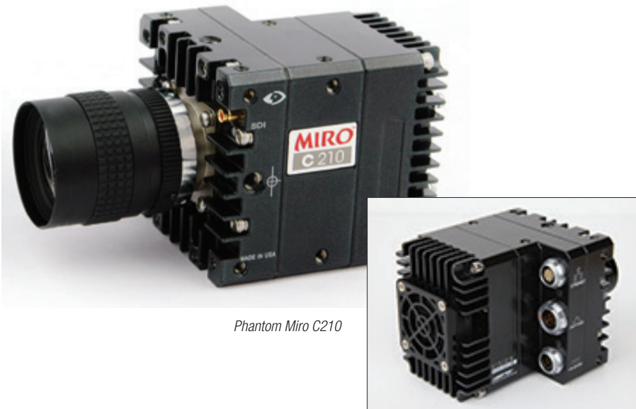
Phantom Miro C210

The Compact & Flexible Solution for a variety of applications